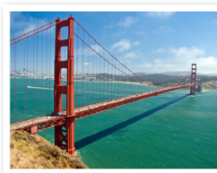
Golden Gate Bridge