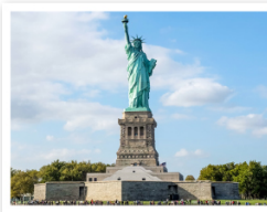
Statue of Liberty