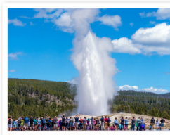
Old Faithful geyser