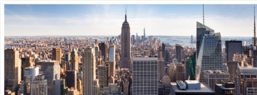
New York City skyline

New York City was the former capital of the USA and is in the south-east of New York state. It is made up of the five boroughs of Manhattan, Brooklyn, the Bronx, Queens and Staten Island. People from around the world visit New York City to experience the rich culture and enjoy its famous landmarks, such as Times Square, Central Park and the Statue of Liberty.